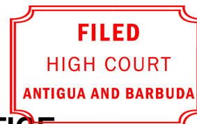
EXHIBIT BUNDLE – GLOBAL PUBLIC NOTICE

In the High Court of Justice, Antigua & Barbuda